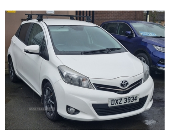
SEE ALL OUR BEST VALUE CARS AT kdkars .com